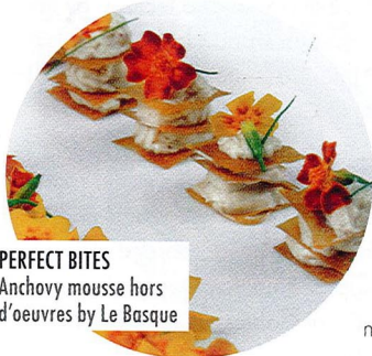
PERFECT BITES Anchovy mousse hors d'oeuvres by Le Basque

The city's party magicians understand that celebration is an art form.